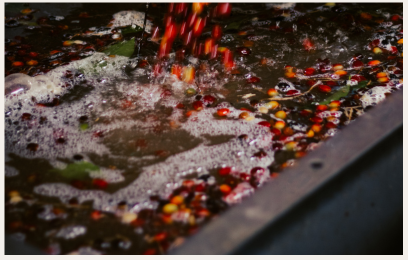
04.DENSITY SORTING WITH WATER

A flotation process is used to separate the cherries unripe or defective ones float and get discarded, while the dense, ripe cherries sink, ensuring a precise selection.